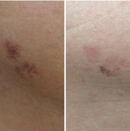
After 1 treatment