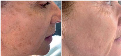
After 2 treatments