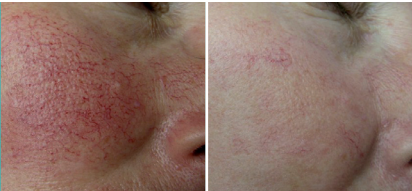
After 2 treatments