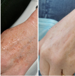
After 1 treatment